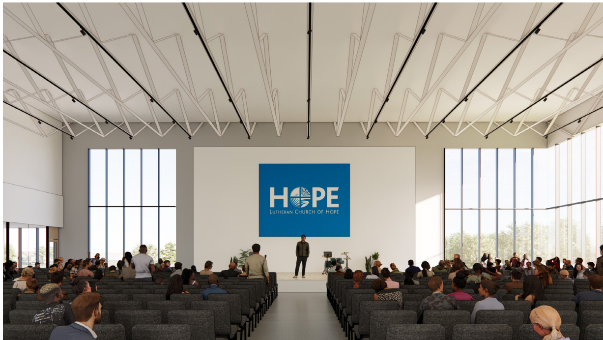
North wall of the worship center

Build the foundation for a missions base in west Ames.