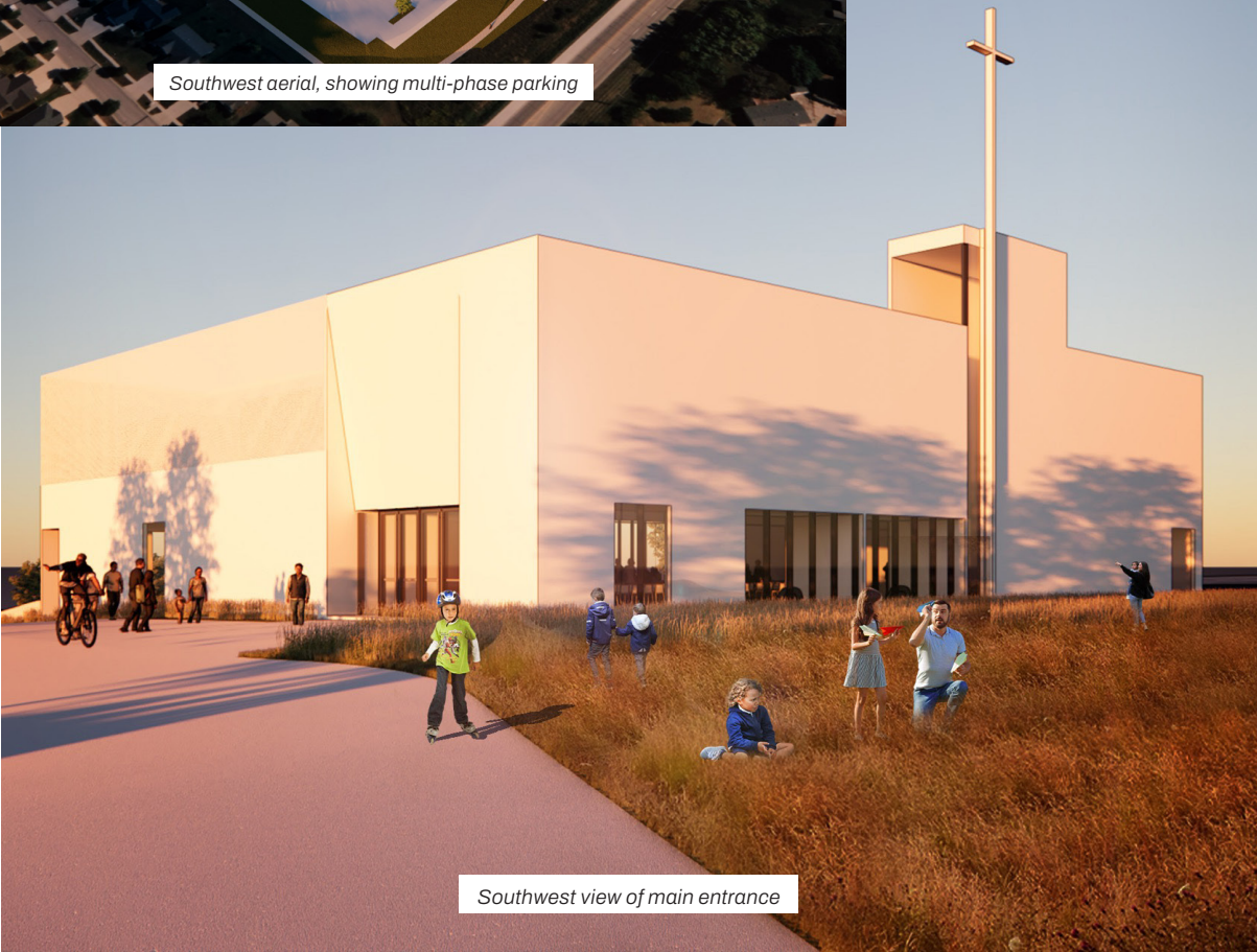
Southwest view of main entrance