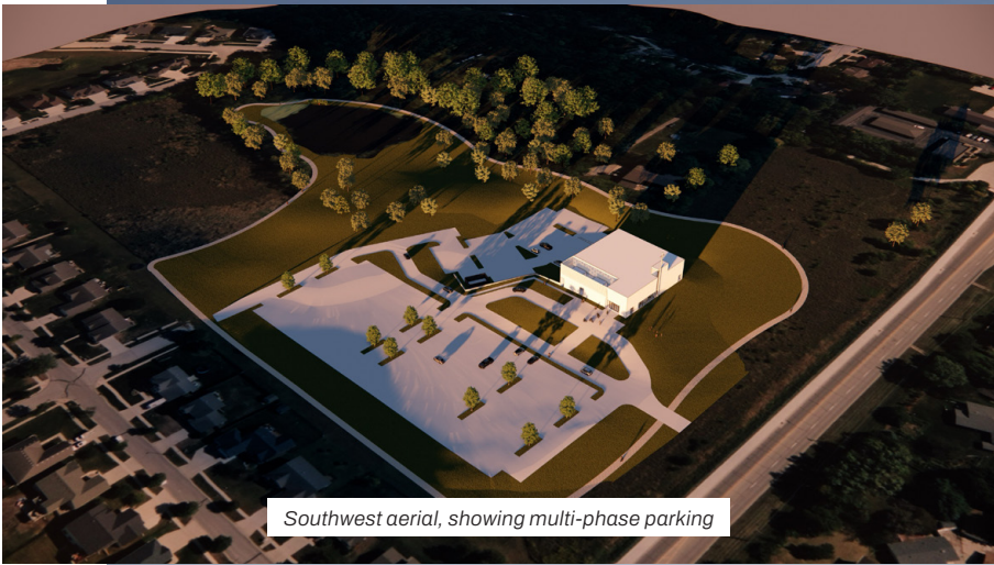
Southwest aerial, showing multi-phase parking