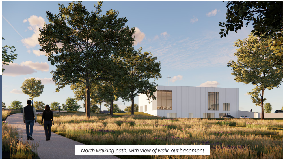
North walking path, with view of walk-out basement