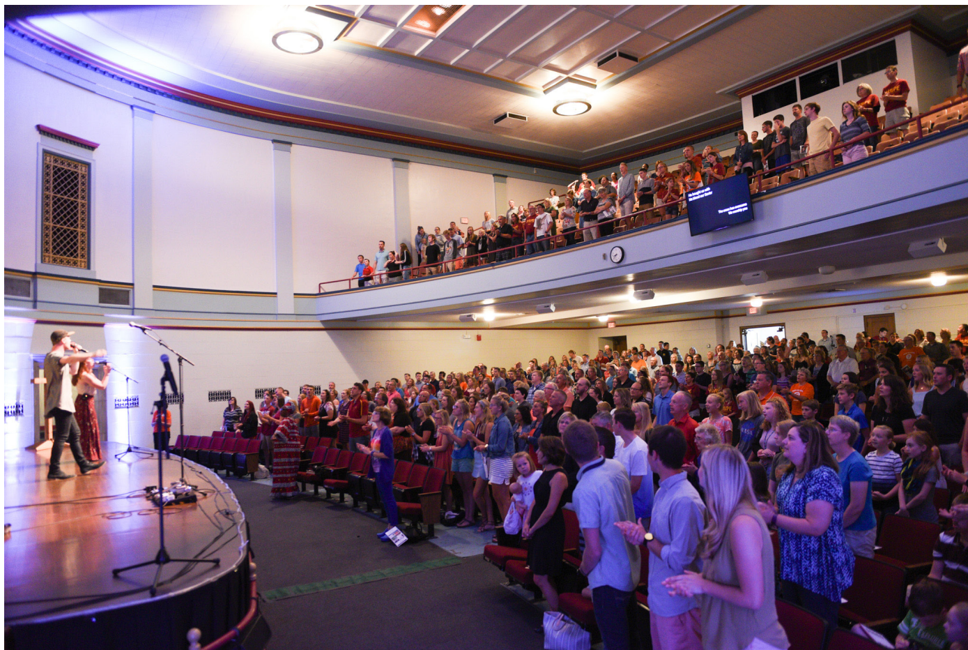
August 20, 2017: Hope Ames launches as a campus

The year 2023 demonstrated the importance of being attentive to God's voice. The opportunity to purchase 22.5 acres of land located at 4925 Lincoln Way arose, and after careful investigation and much prayer, the congregation voted to sell the land in north Ames and purchase the new parcel. This land, situated in west Ames, contains beautiful natural features like a pond, timber, and sloped terrain that will allow a walk-out lower level in the building. It is also accessible by public transportation and will be a wonderful way to continue to reach out to the world around us and share the everlasting love of Jesus!